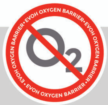
SealPlus Film Wall 75 e 110µ